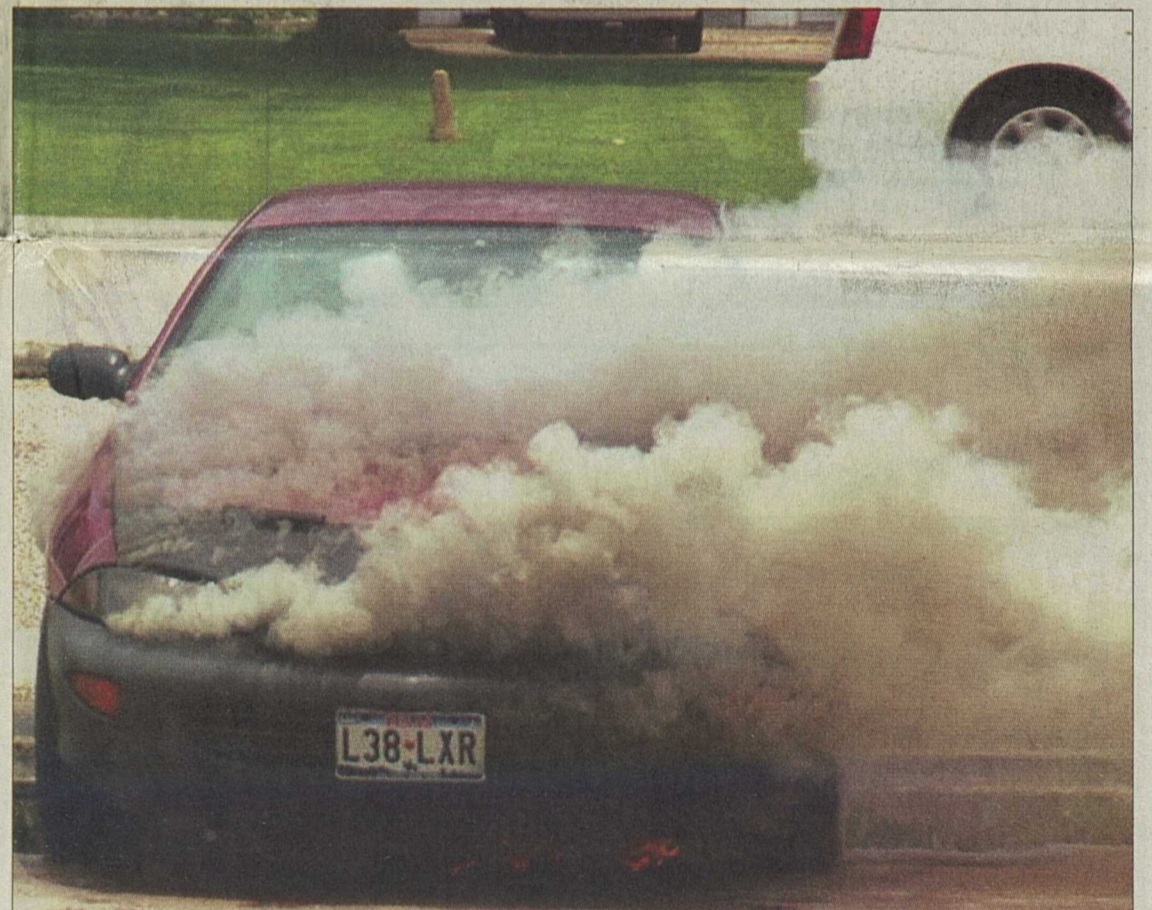
About 12:30 on Saturday the Eagle Lake Volunteer Fire Department was called out to a car fire in the parking lot of Eagle Lake Drugstore. No injuries were reported as a result of the fire.

The plant employs about 250 people and manufactures equipment for oil field services.